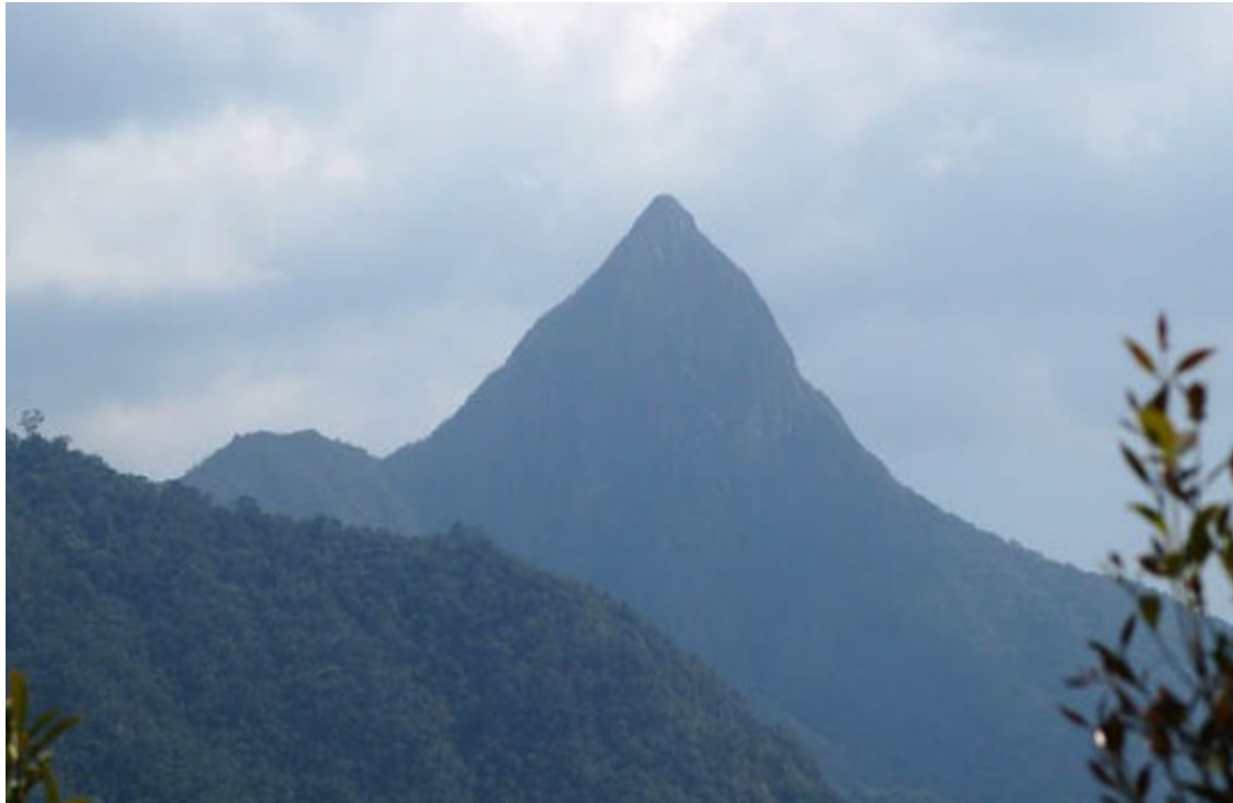
Jianfengling Nature Reserve (CN510) is an area of tropical forest with endemic bird species such as Hainan Partridge Arborophila ardens .

Key: ● = Protected; ◐ = Partially protected; ○ = Unprotected.