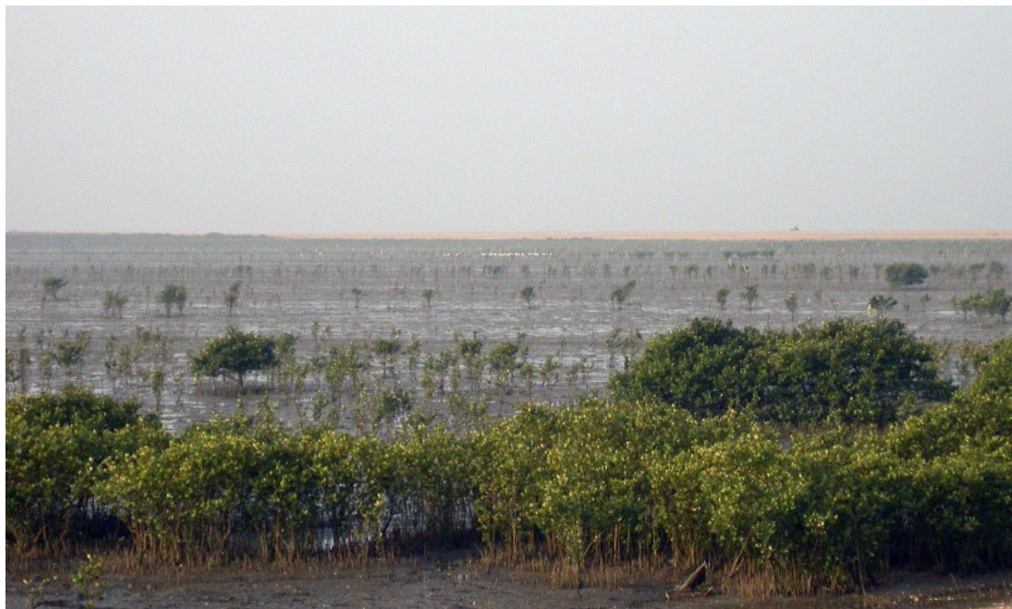
Beili Wan Sigeng (CN507) was recently discovered to be a wintering site of Black-faced Spoonbill Platalea minor .

IMPORTANCE TO OTHER FAUNA AND FLORA: No information.