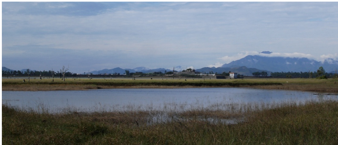
Several rare and threatened bird species were recently found at Gongping Dahu (CN497), including wintering Black-faced Spoonbill Platalea minor .

IMPORTANCE TO OTHER FAUNA AND FLORA: No information.