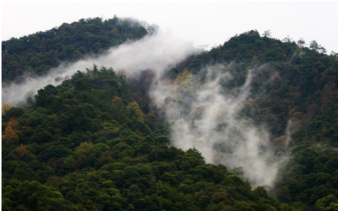
Chebaling Nature Reserve (CN492) was established for the protection of South China Tiger Panthera tigris , and it supports a population of the threatened White-eared Night-heron Gorsachius magnificus .

Key: ● = Protected; ◐ = Partially protected; ○ = Unprotected.