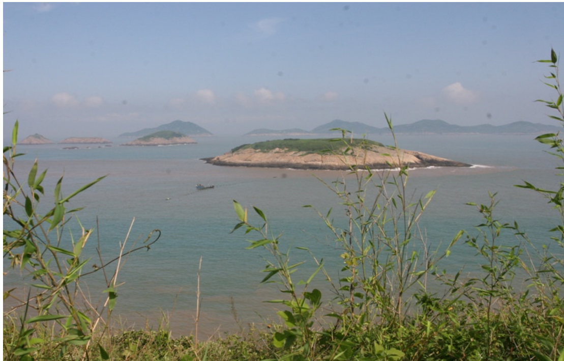
The Jiushan Islands (CN387) support nesting colonies of terns, and they are one of only two breeding sites of Chinese Crested Tern Sterna bernsteini in the world, but the terns are threatened by egg collection.

Key: ● = Protected; ◐ = Partially protected; ○ = Unprotected.