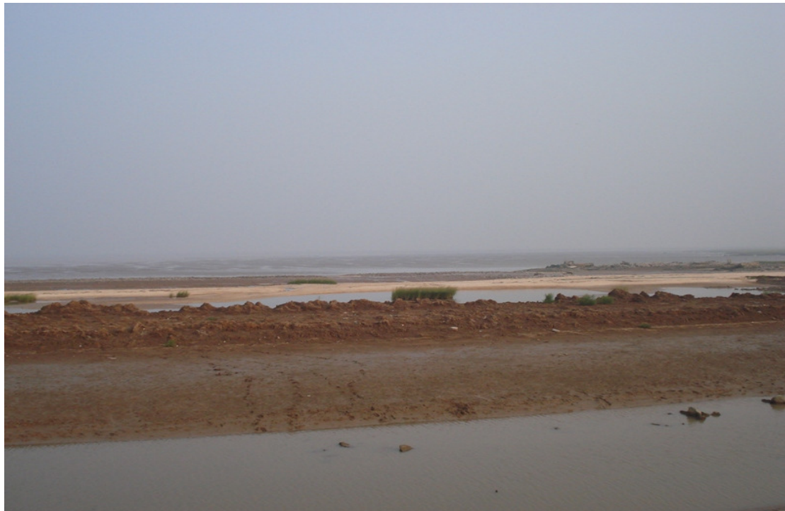
Liangyungang (CN365) is a coastal mudflat in northern Jiangsu, where large flocks of shorebirds have recently been recorded on migration.

Key: ● = Protected; ● = Partially protected; ○ = Unprotected.