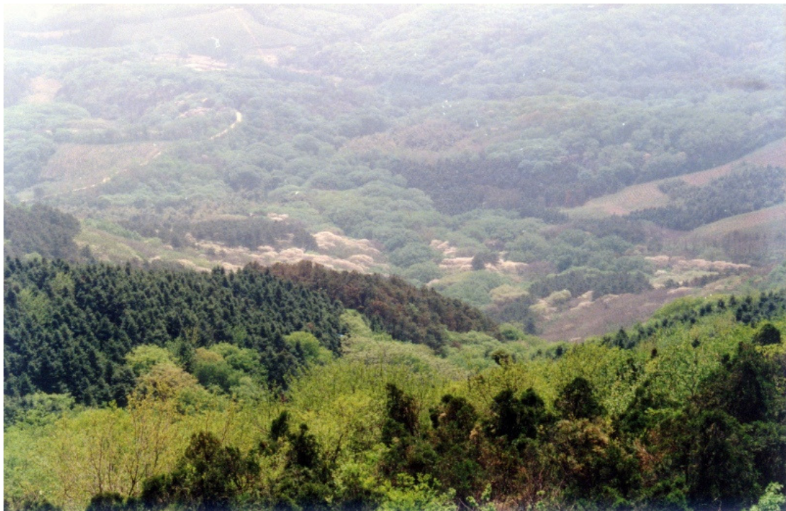
Huangfu Shan Nature Reserve (CN355) has the best preserved montane forest in Anhui, and supports subtropical bird species including breeding Fairy Pitta Pitta nympha .

Key: ● = Protected; ◐ = Partially protected; ○ = Unprotected.