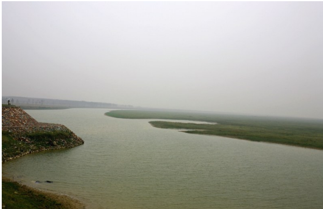
Zhengzhou Huanghe Shidi (CN338) is a wetland located in the lower reaches of the Yellow River, which is a wintering area for many waterbirds and Great Bustard Otis tarda .

Key: ● = Protected; ● = Partially protected; ○ = Unprotected.