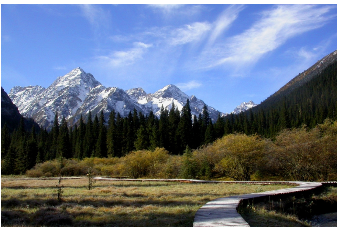
Wanglang (CN186) was established as a nature reserve in the 1960s for the protection of Giant Panda Ailuropoda melanoleuca , and also protects many rare montane bird species.

Key: ● = Protected; ○ = Partially protected; ○ = Unprotected.