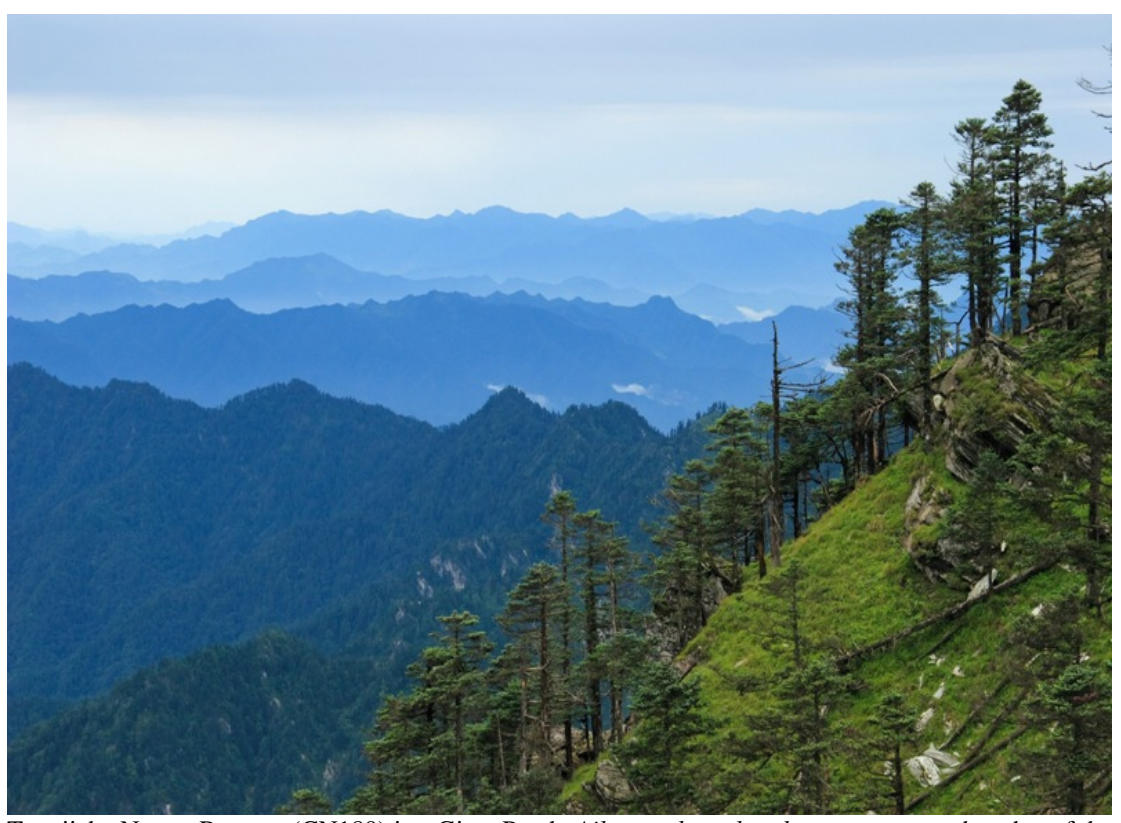
Tangjiahe Nature Reserve (CN189) is a Giant Panda Ailuropoda melanoleuca reserve at the edge of the Sichuan basin.

ENDEMIC BIRD AREAS: 137: Central Sichuan mountains; 138: West Sichuan mountains BIOMES: AS07: Sino-Himalayan temperate forest; AS08: Sino-Himalayan subtropical forest IMPORTANCE TO OTHER FAUNA AND FLORA: Nationally protected plants include Davidia involucrate , Tetracentron sinense and Cathaya argyrophylla . Animals include Panthera tigris amoyensis , Panthera pardus , Neofelis nebulosa , Presbytis francoisi , Macaca mulatta , Manis pentadactyla , Viverra zibetha and Viverricula indica .