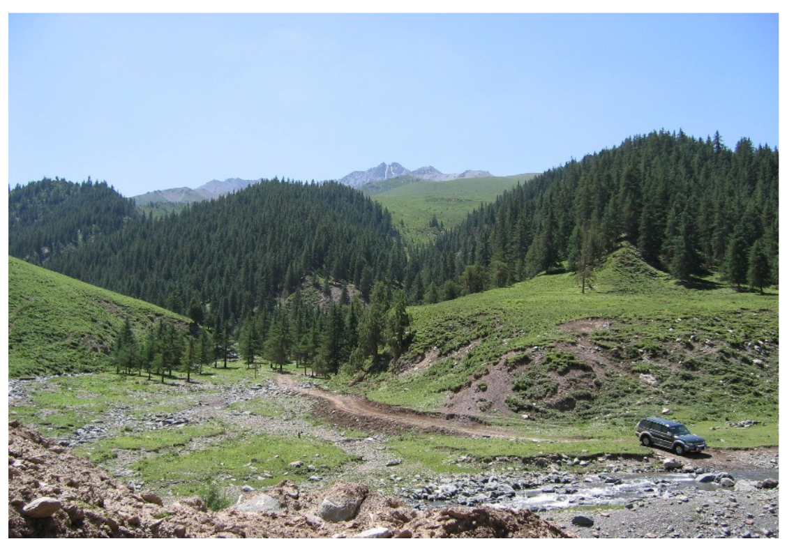
The Dunhuang Nature Reserve and Western Qilian Shan Mountains IBA (CN159) is important for both birds and large mammals.

IMPORTANCE TO OTHER FAUNA AND FLORA: Many protected mammals are found in this nature reserve, such as Snow Leopard, Lynx, Mongolian Wild Ass, Tibetan Wild Ass, Wild Camel etc.