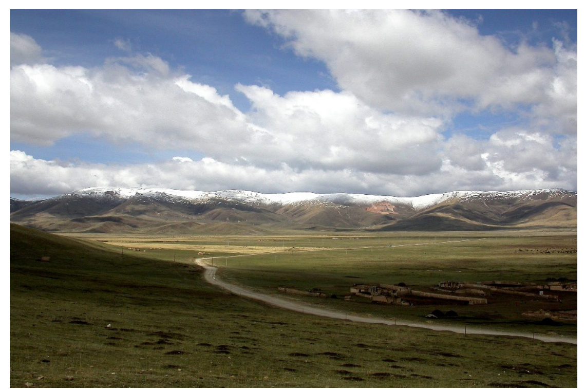
Huang He Shouqu Nature Reserve (CN166) is located in the Tibetan region of southern Gansu and is connected to Zoigê Marshes (CN182) in Sichuan.