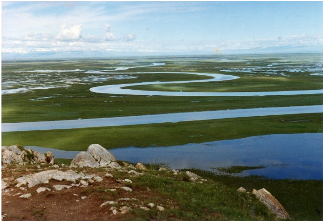
Bayanbulak (CN114), the famous 'Xinjiang Swan Lake'.

Key: ● = Protected; ● = Partially protected; ○ = Unprotected.