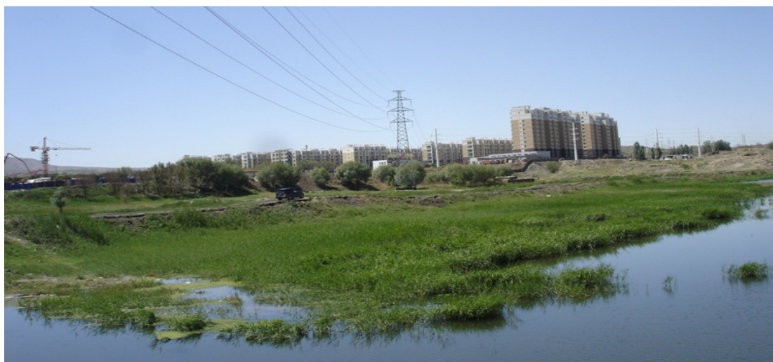
White-headed Duck Oxyura leucocephala was recently discovered to breed in the Desert and Wetland from Northern Urumqi to Dabancheng IBA (CN097).

IMPORTANCE TO OTHER FAUNA AND FLORA: Nationally protected animals include Gazella subgutturosa . The northern part of the area is within the historical ranges of Camelus ferus , Equus hemionus , Gazella subgutturosa and Saiga tatarica .