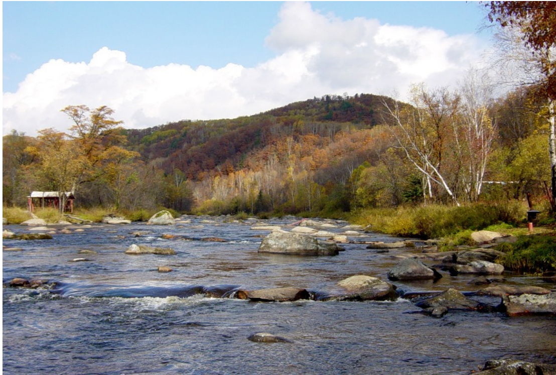
Liangshui Nature Reserve (CN020) is a breeding site of Scaly-sided Merganser Mergus squamatus .