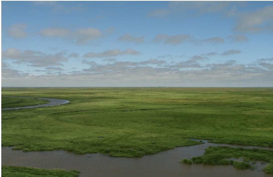
The natural wetland landscape at Yanwodao in Naoli He Nature Reserve (CN032), a remnant of the vast wetlands that used to cover this part of the Sanjiang floodplain before large scale development took place.

Key: ● = Protected; ◐ = Partially protected; ○ = Unprotected.