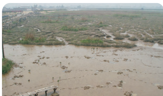
Min Jiang Estuary in Fujian Province, southeastern China, is a very important site for many threatened species such as Spoonbilled Sandpiper and Chinese Crested-tern. The area is also under very high development pressure

The first list of Important Bird Areas in China was published as part of an Asia-wide inventory of IBAs in 2004 (BirdLife International 2004) with 445 sites identified in China mainland based on the work and survey done before 2003. Building on this work, this publication presents a more detailed and comprehensive inventory of 512 sites in China mainland, covering a total area of 1,185,543 km 2 or 12.4% of the land area, plus a further 56 sites in Hong Kong, Macao and Taiwan. This English summary sets out a justification for this work, the methodology used, and an analysis of the inventory. A list of sites on a province by province basis is provided in table 1, including information on the IBA criteria they meet, and the extent to which they are protected. More detailed information is then presented in Chinese on each of the sites.