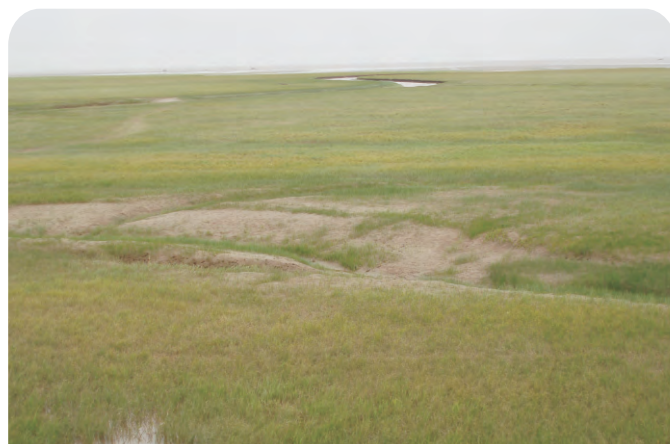
Chongming Dongtan, or the tidal flat of eastern Chongming Dao at the Yangtze Estuary is identified as an IBA because of its importance to threatened species such as Black-faced Spoonbill and Hooded Cranes, and the high number of migratory waterbirds such as shorebirds using this site as stop-over. It is a Ramsar Site and a network site on the East Asian Australasian Flyway Partnership. 位于长江口的崇明东滩对保护受胁鸟类如黑脸琵鹭、白头鹤等十分重要，同时也是以万计迁徙水鸟如鸕鹚类的重要驿站，所以被选为重点鸟区。它是拉姆萨尔湿地公约附表上的国际重要湿地，以及东亚-澳大利西亚迁飞网络伙伴关系的一个重要的网络保护区。

This Partnership has been set-up to promote the conservation of waterbirds and their habitats along the East Asian Australasian migration flyway. The Partnership brings together government agencies and civil society organizations, and aims inter alia to develop flyway site networks for migratory waterbirds. This inventory of Important Bird Areas can assist in the identification of sites that might be included in the flyway networks.